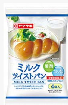
Milk Twist Bread