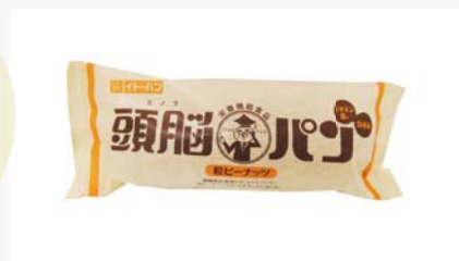
“Zuno Pan” (Brain Bread)