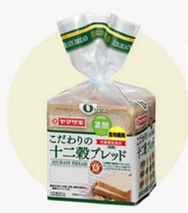
Juni-koku (12-grain) bread