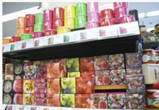
The 2010 tea importing volume and value are as below.

In Japan, black tea beverage industry is getting great attention. New products are being introduced, and the market is becoming active. The appeal is in the variety of types and flavor, along with reducing sugar to cut calories but have sweetness. Itoen's "Tea's Tea New York" sold 5 million boxes (120 million bottles) in the first 11 months. The reason behind the success was its scent of fresh fruits and lightly sweetened taste. It shows consideration to health reducing its calories and cutting down 50% of the caffeine. As a result, it is getting support from both men and women in their 30s~40s along with people in their 20s. With the attention attracting domestic market in the background, the import value and quantity of tea in 2010 both increased 14% year to year doing very well.